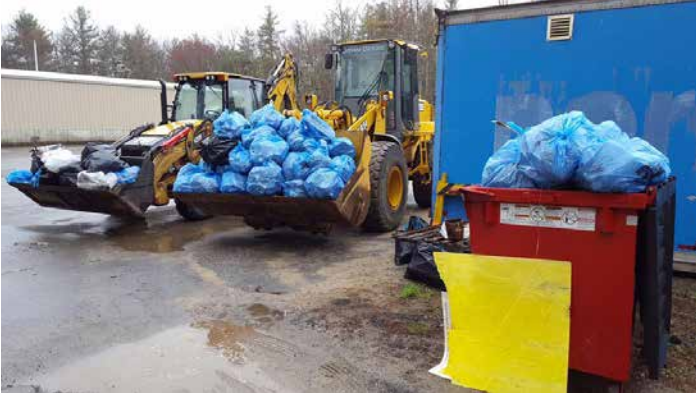
Front-loaders hauled the bags.

Thanks a heap, a giant trash heap that is. Look at the success of this year's roadside clean-up! We would like to thank everyone who came out on April 22 to help clean up the town for Earth Day. We had our largest turnout of volunteers this year for our 6th annual clean-up event. The dumpster was filled to overflowing. It wasn't the best weather but that didn't stop the community from coming together. It was great to see so many families, neighborhoods, and individuals who care about the appearance of our town and choose to volunteer their time. Thank you to the members of the Boy Scouts, Cub Scouts, and Girl Scouts for their community service as well.