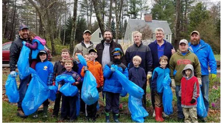
Cub Scouts did a phenomenal job.