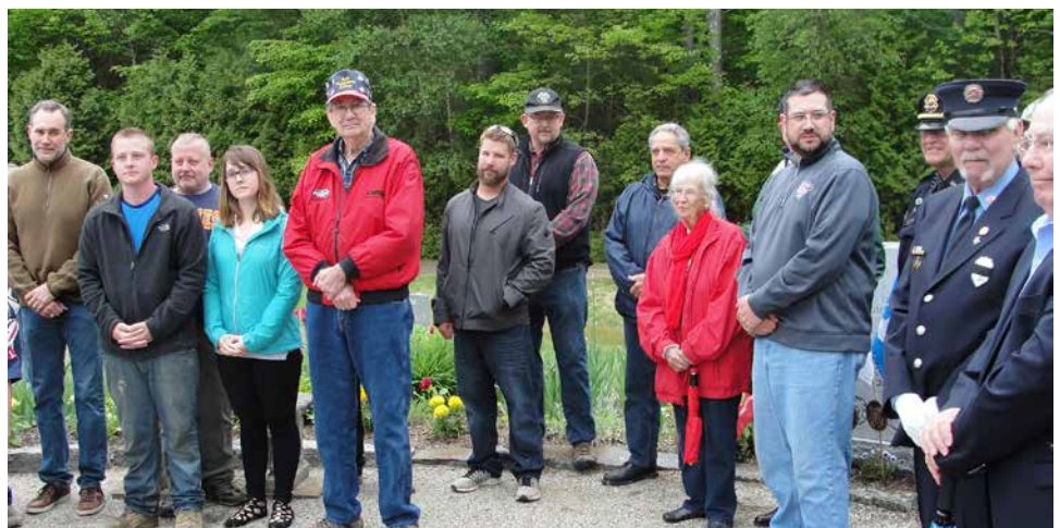
Brentwood veterans were honored for their service to the country.