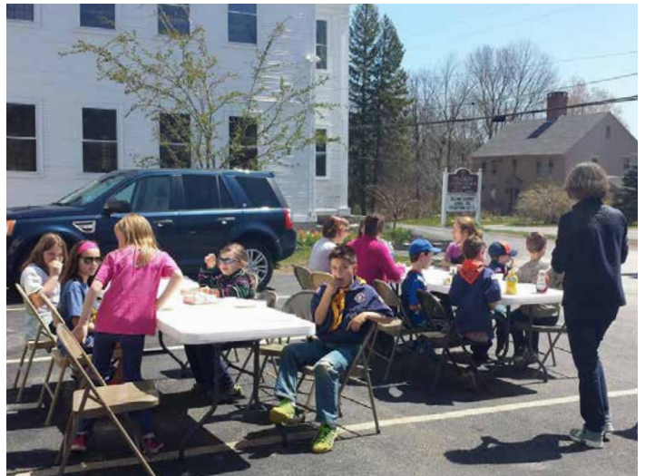
Girl Scouts & Cubs loved the barbecue.

We also enjoyed a fun barbeque after to celebrate our hard work. Nothing says good time spent outdoors like hamburgers, hotdogs and ice cream.