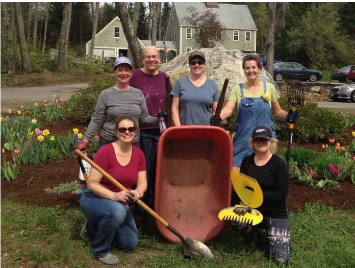
Gardeners cleaned the municipal gardens.