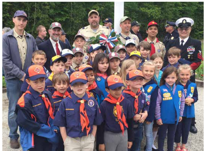
Cub Scouts and Girl Scouts assisted at the Memorial Day ceremonies.