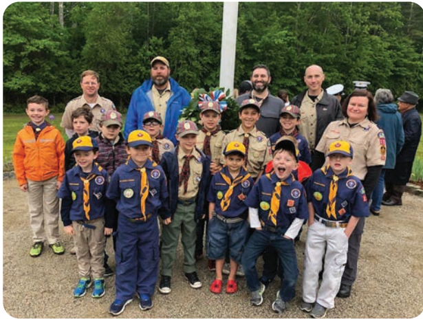
Scouts and leaders from Brentwood Pack 192 assist at the Memorial Day service at Tonry Cemetery on May 28th.