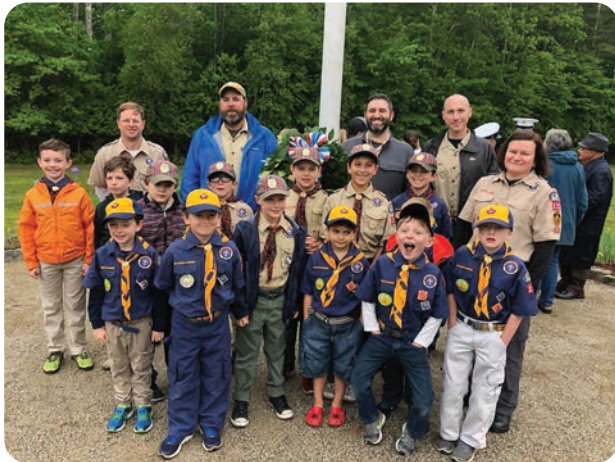
Scouts and leaders from Brentwood Pack 192 assist at the Memorial Day service at Tonry Cemetery on May 28th.