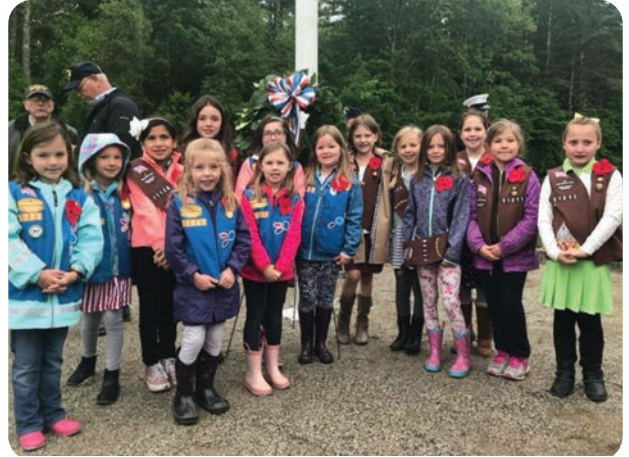
Brentwood Girl Scouts participated in Memorial Day ceremony at Tonry Cemetery.

Julie Morrow for the Brentwood Girl Scout Troops